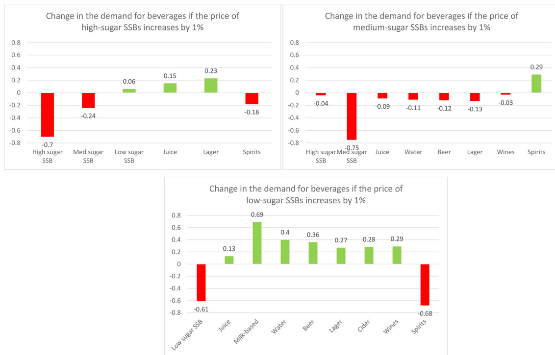
Figure 1 Change in the demand if price of SSBs increases (full sample, N=575 965). High-sugar SSBs include >8g of sugar per 100mL; medium-sugar SSBs include 5–8g of sugar/100mL and low-sugar SSBs have <5g of sugar/100mL.

non-alcoholic beverages suggests an urgent need for follow-up work based on with primary research to understand the reasons for the relationships.