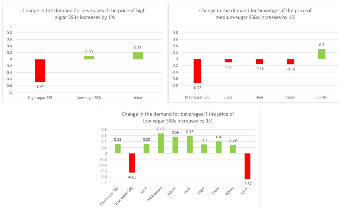
Figure 2 Change in the demand if price of SSBs increases (low-income sample; N=198 464). High-sugar SSBs include >8g of sugar per 100mL; medium-sugar SSBs include 5–8g of sugar/100mL and low-sugar SSBs have <5g of sugar/100mL.

middle-income group and decrease in cider for the high-income group. An increase in the price of medium-sugar drinks tends to reduce purchase of beer, and lager across all income groups, generating a ‘healthy multiplier’ effect for the price increase. An increase in the price of diet/low-sugar drinks, however, generates increased purchase of all categories of alcohol with the exception of spirits. On balance, a policy to increase the price of SSB needs