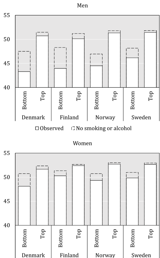
Figure 2 Observed temporary life expectancy and temporary life expectancy subtracting smoking-related and alcohol-related deaths in the top and bottom income quintiles, men and women in Denmark, Finland, Norway and Sweden, 25–79 years, 1995–2007.

expectancy disadvantage in both Denmark and Finland, alcohol was comparatively more important among Finnish men. Norwegian men had an advantage in terms of alcohol-related mortality