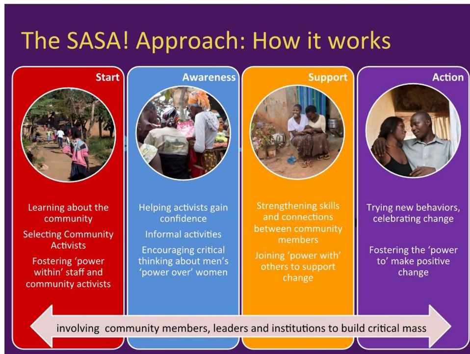
Figure 1 Four phases of SASA!