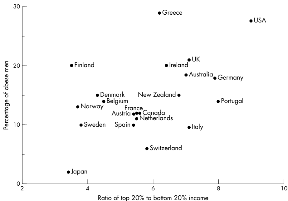
Figure 1 The relation between male obesity and income inequality in 21 rich countries.

most unequal. Gini coefficients of inequality from the same source were also investigated. The Gini coefficient is a measure of income inequality that varies between 0 (equality) and 1 (maximum inequality). 16