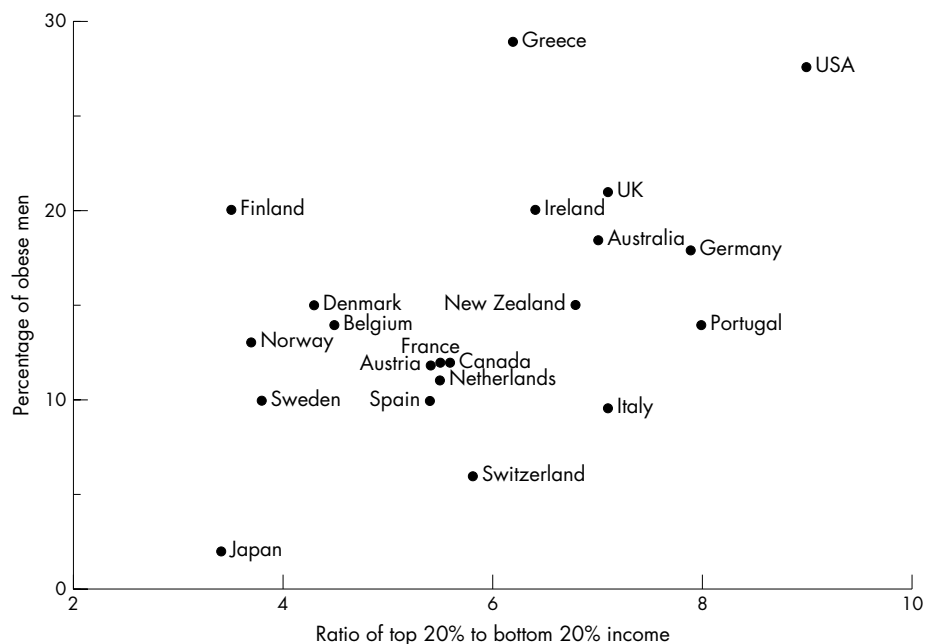
Figure 1 The relation between male obesity and income inequality in 21 rich countries.

most unequal. Gini coefficients of inequality from the same source were also investigated. The Gini coefficient is a measure of income inequality that varies between 0 (equality) and 1 (maximum inequality). 16