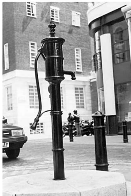
A facsimile of the famous Broad Street pump in Soho, London, near the spot where John Snow's famous intervention took place in the cholera outbreak of 1854.

North West Public Health Team, Department of Health, 18th Floor, Sunley Tower, Piccadilly Plaza, Manchester M1 4BE, UK; johnrashton@blueyonder.co.uk