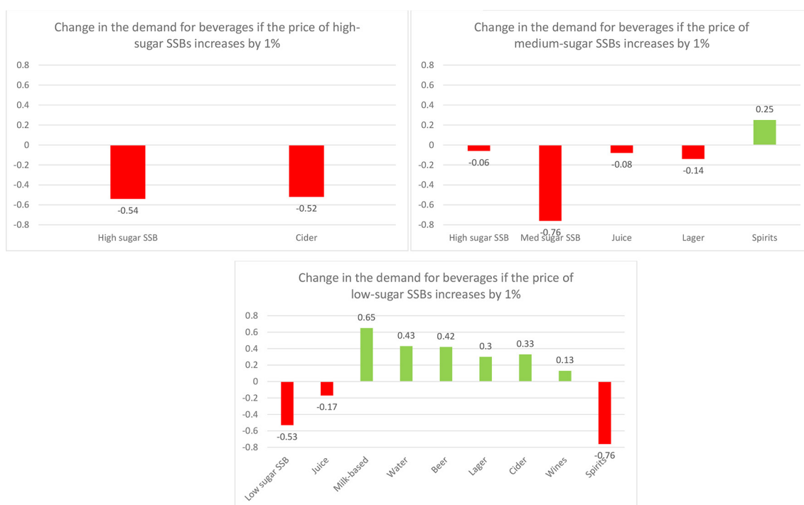
Figure 4 Change in the demand if price of SSBs increases (high-income sample; N=89 535). High-sugar SSBs include >8g of sugar per 100mL; medium-sugar SSBs include 5–8g of sugar/100mL and low-sugar SSBs have <5g of sugar/100mL.

recoup the levy from consumers with an option to increase the price of all drinks, including diet drinks. If so, this could reduce the beneficial effects from a rise in the price of medium-sugar drinks and add negative effects from diet drink price increases through the increased purchase of alcohol. Although not definitive, the relationships found in this analysis are sufficiently robust