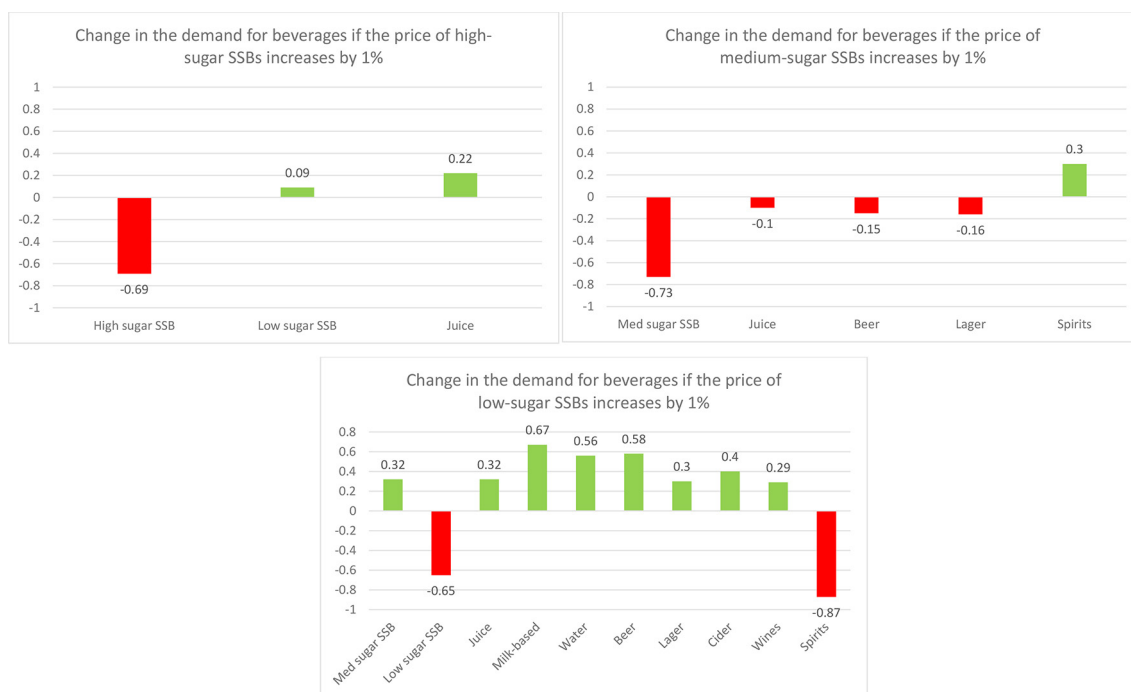
Figure 2 Change in the demand if price of SSBs increases (low-income sample; N=198 464). High-sugar SSBs include >8g of sugar per 100mL; medium-sugar SSBs include 5–8g of sugar/100mL and low-sugar SSBs have <5g of sugar/100mL.

middle-income group and decrease in cider for the high-income group. An increase in the price of medium-sugar drinks tends to reduce purchase of beer, and lager across all income groups, generating a ‘healthy multiplier’ effect for the price increase. An increase in the price of diet/low-sugar drinks, however, generates increased purchase of all categories of alcohol with the exception of spirits. On balance, a policy to increase the price of SSB needs