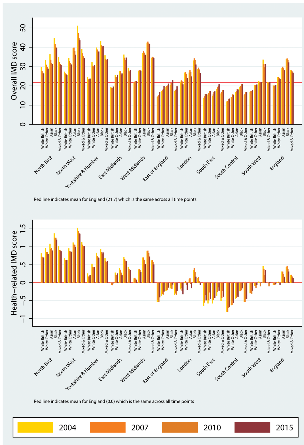
Figure 4 Median overall deprivation (top) and health domain deprivation (bottom) by ethnicity and region, 2004–2015. IMD, Index of Multiple Deprivation. The colour version of this figure is available online.

extent due to changes in the IMD distribution, with the exception of those aged 0–29 (online supplementary appendix 1). This is in agreement with previous work, where very strong correlations were identified over time for IMD at the LSOA level, 19 while the influence of population migration on inequalities is known to vary by age. 32 Deprivation immobility is a major concern and has been linked to very high levels of premature mortality. 33