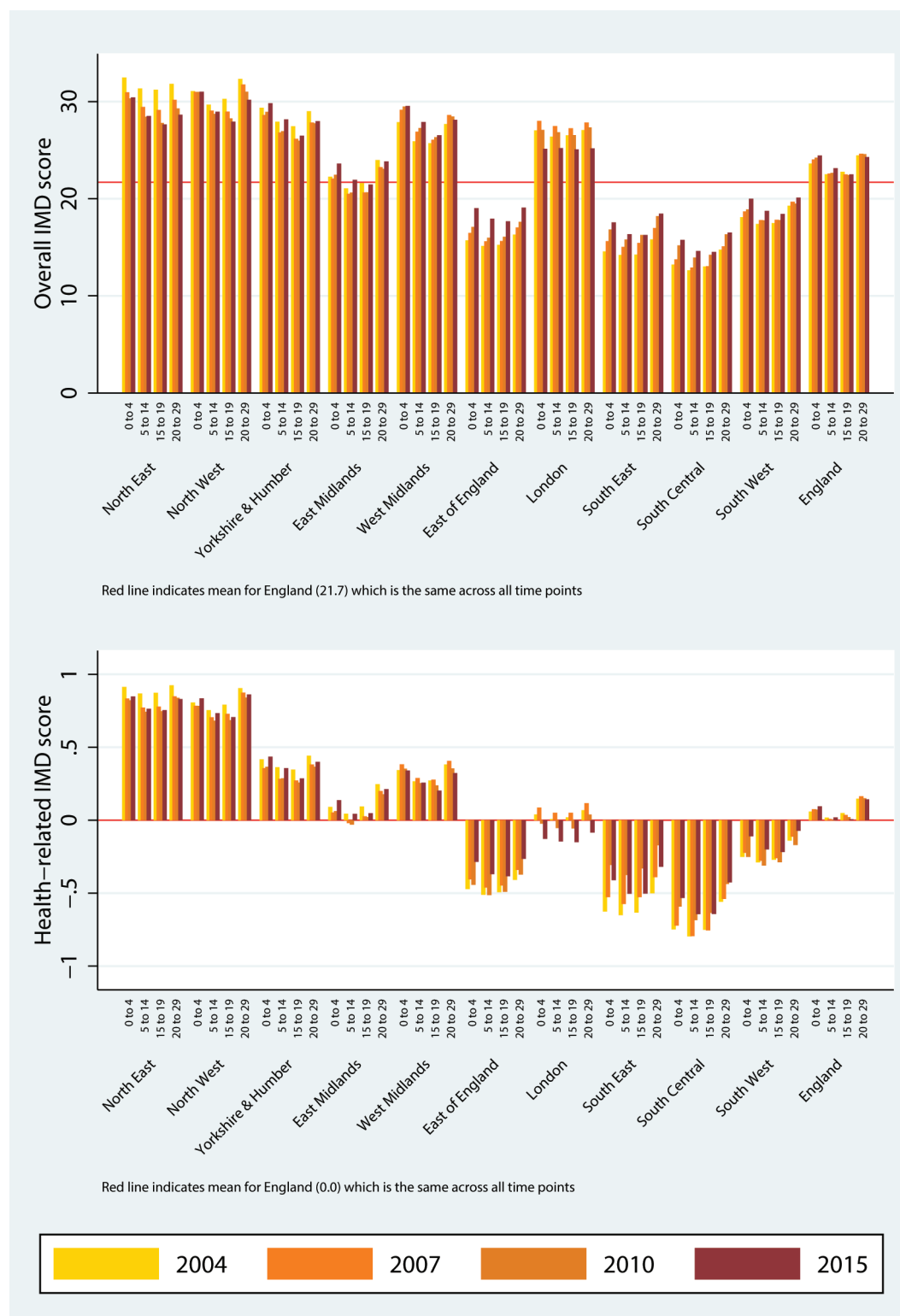
Figure 3 Median overall deprivation (top) and health domain deprivation (bottom) by under 30 age group and region, 2004–2015. IMD, Index of Multiple Deprivation. The colour version of this figure is available online.

has been negated post-Brexit. 28 This imbalance between house prices, driven by supply and demand (with recent policy aiming to drive down demand by targeting the buy-to-let market), 29 and real pay, driven by global pressures and pension deficits, 30 has put considerable pressure on the younger generation. This pressure does not seem to be limited to those of working age, but applies to infants and children, possibly indicating rising costs