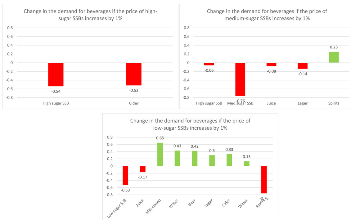
Figure 4 Change in the demand if price of SSBs increases (high-income sample; N=89 535). High-sugar SSBs include >8g of sugar per 100mL; medium-sugar SSBs include 5–8g of sugar/100mL and low-sugar SSBs have <5g of sugar/100mL.

recoup the levy from consumers with an option to increase the price of all drinks, including diet drinks. If so, this could reduce the beneficial effects from a rise in the price of medium-sugar drinks and add negative effects from diet drink price increases through the increased purchase of alcohol. Although not definitive, the relationships found in this analysis are sufficiently robust