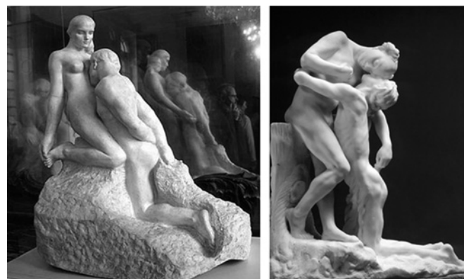
Rodin's 'The Eternal Idol'