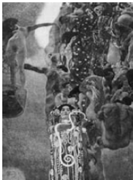
Figure 3 Gustav Klimt, 'Medicine'. Oil on canvas, 430×300 cm.

Some authors consider that creativity is the combination of individual talent, which, using the rules and symbols of a specific discipline whether in art or in science, generates a new idea or produces something new and the acceptance of this contribution by the persons and institutions legitimised to evaluate whether or not it should be included within the