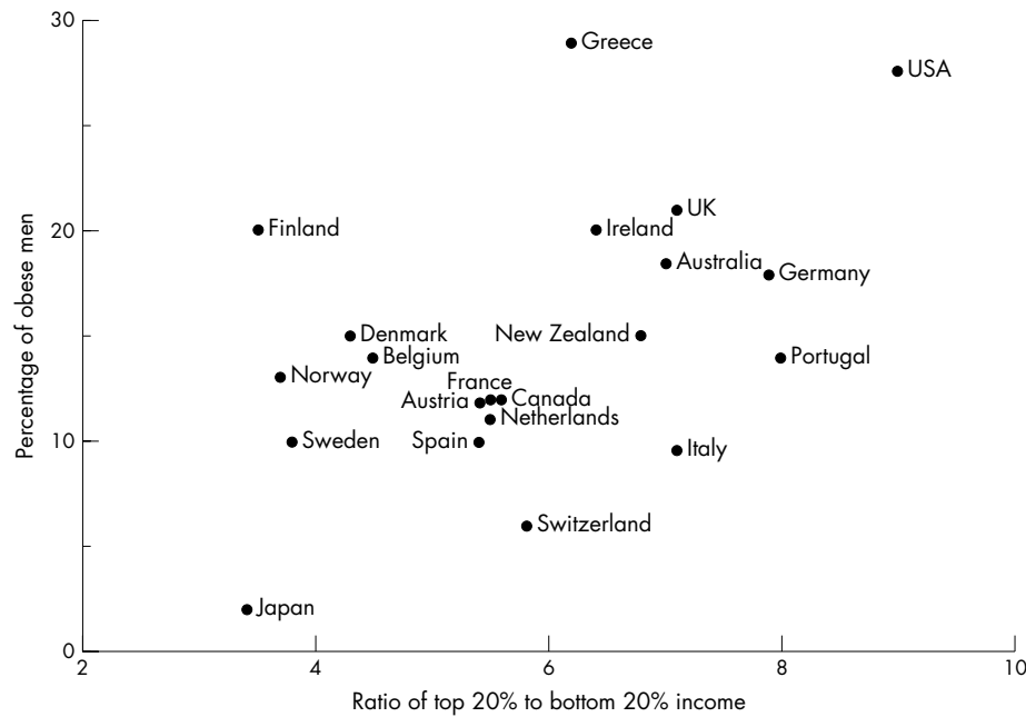
Figure 1 The relation between male obesity and income inequality in 21 rich countries.

most unequal. Gini coefficients of inequality from the same source were also investigated. The Gini coefficient is a measure of income inequality that varies between 0 (equality) and 1 (maximum inequality). 16